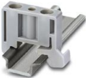
End clamp width: 6 mm, color: gray

Please be informed that the data shown in this PDF Document is generated from our Online Catalog. Please find the complete data in the user's documentation. Our General Terms of Use for Downloads are valid ( http://phoenixcontact.com/download )